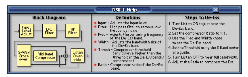
The Help Screen

Pressing the help screen (?) button brings up a quick-start screen to quickly get you using the plug-in. It's also useful for quick reference.