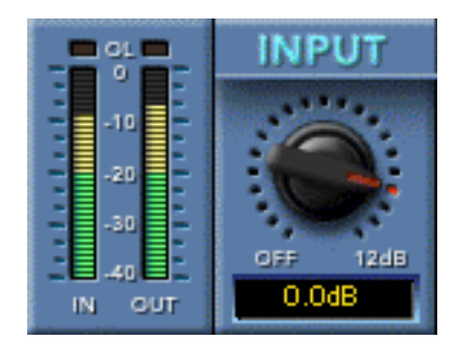
DSR-1 I/O Levels