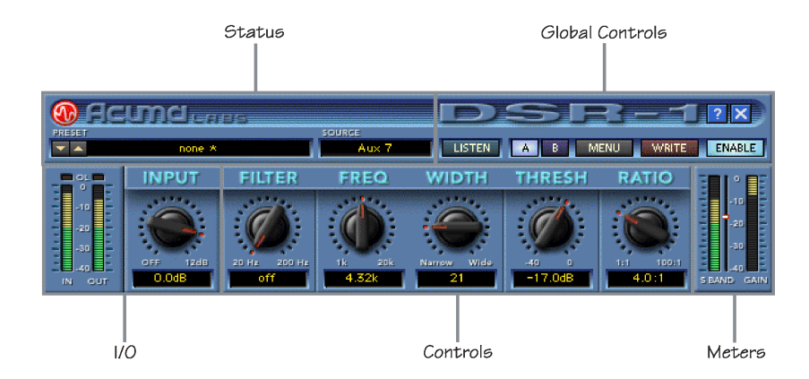
DSR-1 Block break down overview

You can think of the DSR-1 as being broken into five basic areas: the status block, global block, I/O block, controls, and meters.